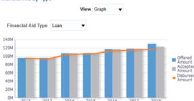
Financial Aid by Type